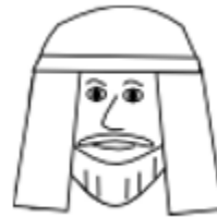
James (brother of John)